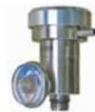
Demand Flow Regulator

Cal Gas Wall Mount 34 L available in red and black 34 L and 58 L adjustable mount available