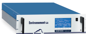
MIR 9000 CLD rack 19" version

Offers excellent performance for multiple gas measurements, including HCl, NO, NO 2 (NO x ), SO 2 , CO, CO 2 , HC, CH 4 (TOC), HF, and O 2