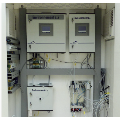
MIR 9000 CLD with the multiplexing system MVS