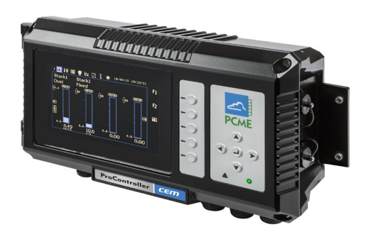
Figure 3: PCME STACKFLOW 400 Lower and Upper Reference Self-Checks