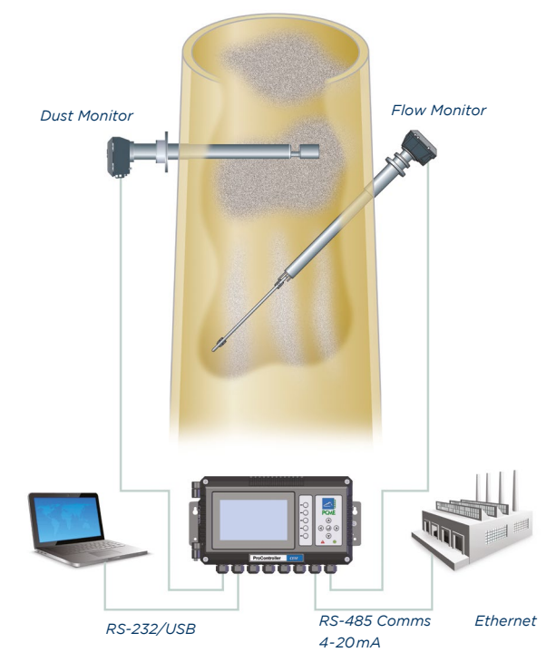
Figure 4: PCME STACKFLOW 400 combined with a PCME dust monitor for integrated concentration and mass emissions reporting