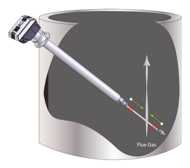
Figure 1: Principle of Operation of the PCME STACKFLOW 400

The stack flow velocity in the measurement path is calculated from the upstream and downstream transit time in a way that is independent of the speed of sound in the gas, flue gas temperature or pressure of flue gas composition. The flow rate is calculated by multiplication of average flue gas velocity by the stack cross-section area.