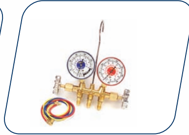
R-410A Manifold Set