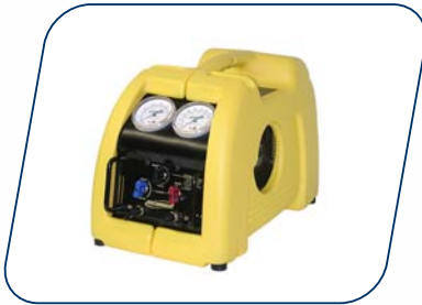
Stinger Refrigerant Recovery Unit