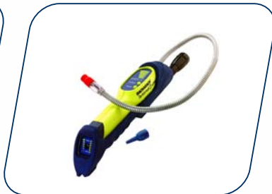
Informant 2 Dual Purpose Leak Detector