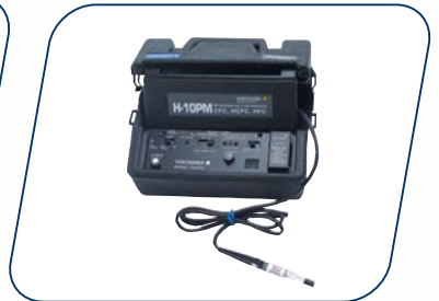
H10PM Refrigerant Leak Detector