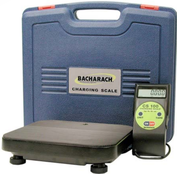
Model CS100 2010-0000