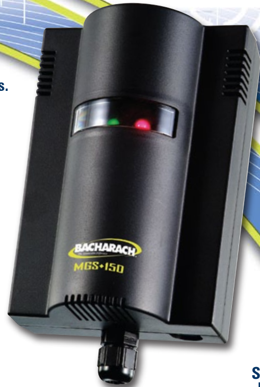
MGS Standard Housing