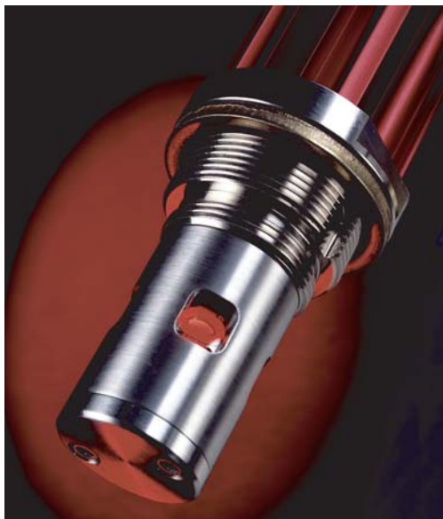
Optional 316 SS sensor housing for applications with high corrosives

A number of different corrosion resistant mirror and sensor housing materials are available, to withstand aggressive sample components in the harshest of applications. High temperature (up to 130°C) and high pressure (up to 250 barg) sensor versions are available. Michell's technical team are always available to advise on the most appropriate choices for your process.