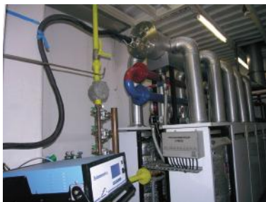
Application example: control processes or combustion gases in all domains