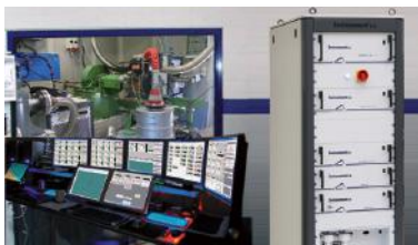
Integration example in motors gas analysis bay