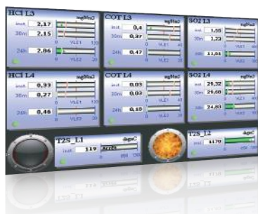
Optional: WEX® advanced CEMS data management and supervision software