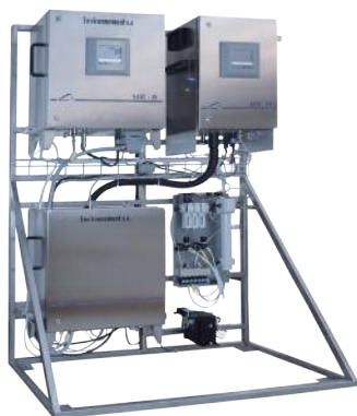
Turnkey system "on frame" including MIR 9000H