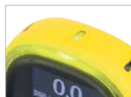
Easy to see