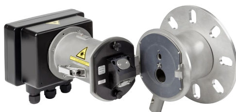
DM 170 shown with Manual Audit Unit