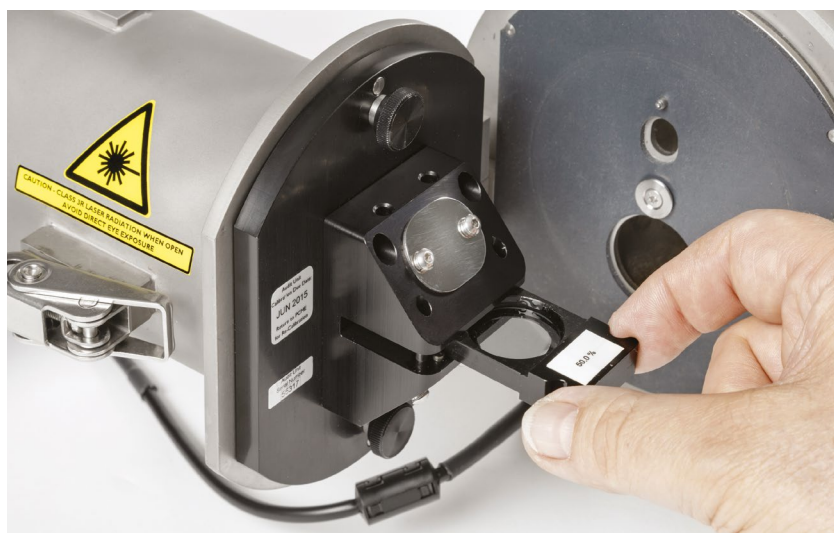
PCME QAL 260 shown with a multi-value Manual Audit Unit and attenuator

The automatic contamination check system (patent pending) ensures that any optical variances are measured, defined and adjusted to ensure zero and span drift is kept to a minimum.